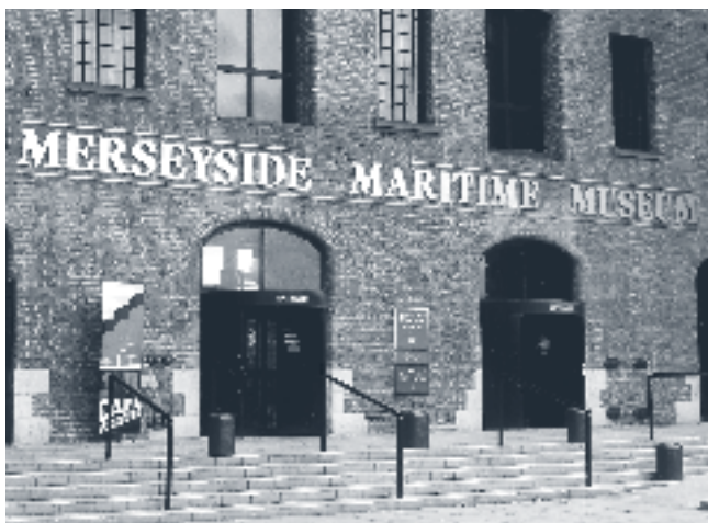
Merseyside Maritime Museum, venue for the DELIVERING BEST PRACTICE WITHIN THE NHS Conference.

The conference was held in the Lecture Theatre of the Merseyside Maritime Museum and refreshments and lunch were served in the Dockside Gallery, overlooking the Albert Dock. This was an excellent venue and the conference proved very popular with over 60 delegates attending.